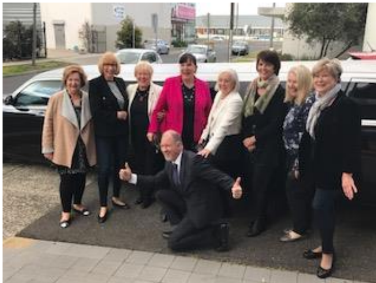
Below: The Western Australian Ladies travelled in extended limousine style!