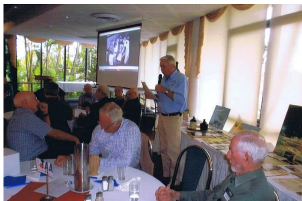
Some of our early DC3 Captains are seen here in the foreground while our Treasurer recited a poem of the Dinosaur Flight