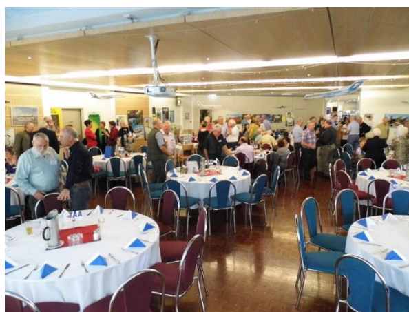
The room was decked out with posters and photos from that yesteryear with the tables set up in red and blue. A video screen showed some films and photos.