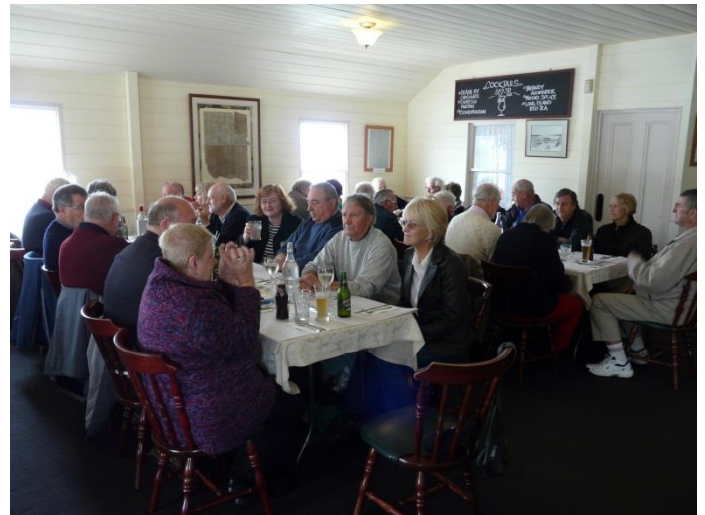
Members at lunch