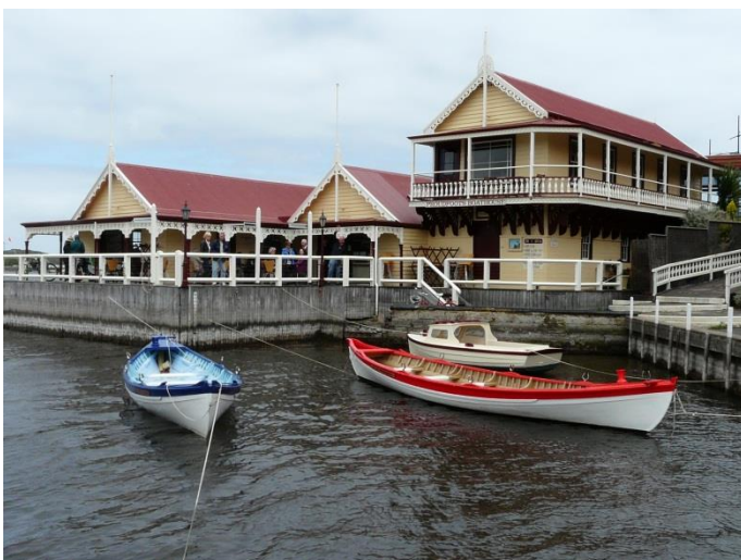
Proudfoot's Boathouse, Warrnambool