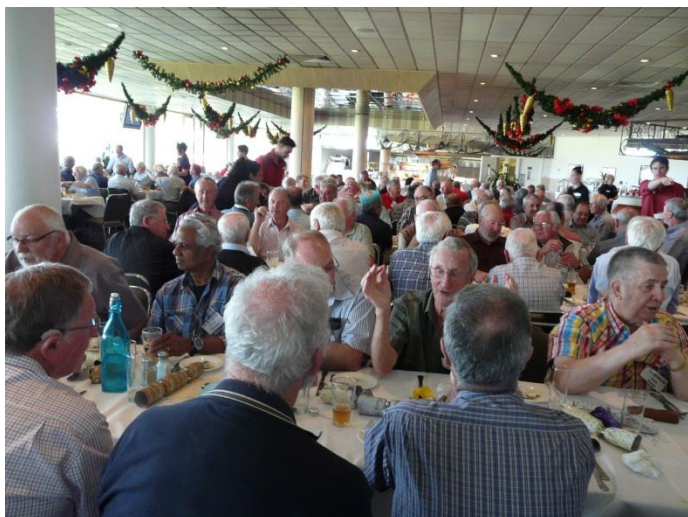
Good old chin wag happening

The November Simply TAA Retired Staff (STAARS) November lunch was one of our most successful lunches yet, in terms of numbers who attended. The meal count was 215, which doesn't include those who wandered between tables and didn't eat. This is a significant achievement and gathering of staff with a link to an airline that operated and dissolved some 20 years ago. Detailed later in this newsletter is information on the origin of STAARS get-togethers.