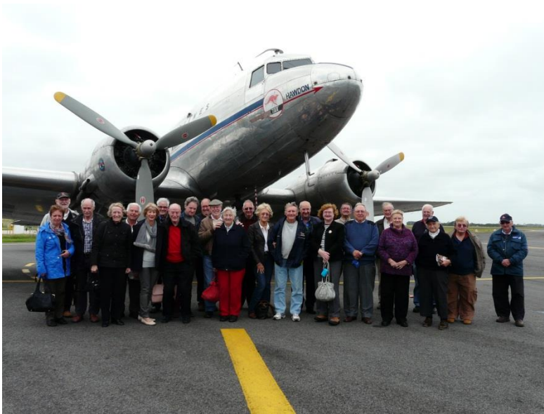
Passengers about to board for a pleasant journey home