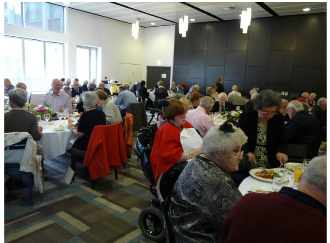
Members at lunch