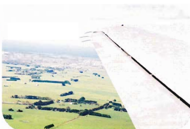
The view out the window towards the coast as the aircraft approaches