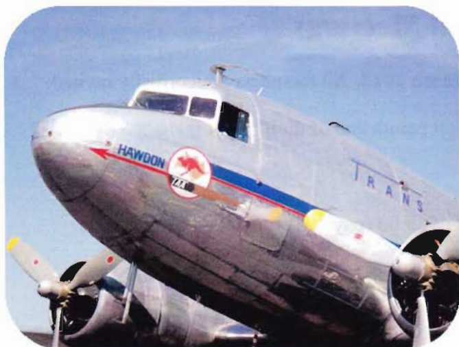
VH-AES 'Hawdon' – an original TAA DC3, all ready to go from Melbourne with our 25 Year Club members.