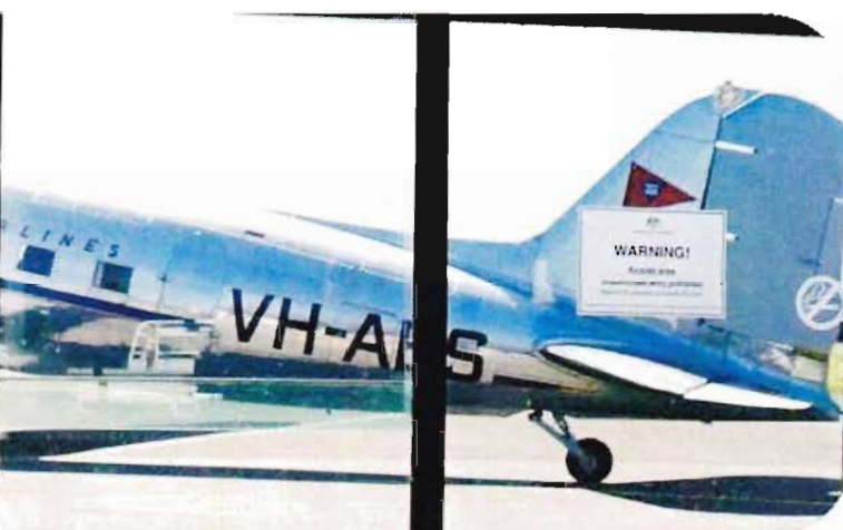
VH-AES 'Hawdon' on the ramp at Warnambool awaiting it's passengers for the return trip to