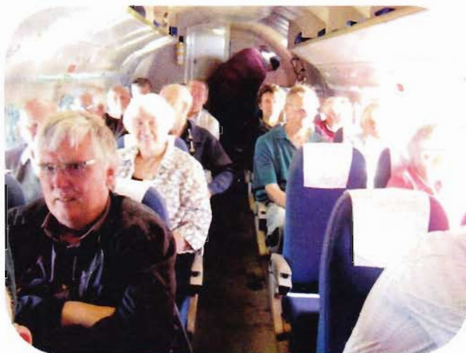
Everyone 's ready to go on the flight to Warnambool. A great time was had by all, and the aircraft operated perfectly.