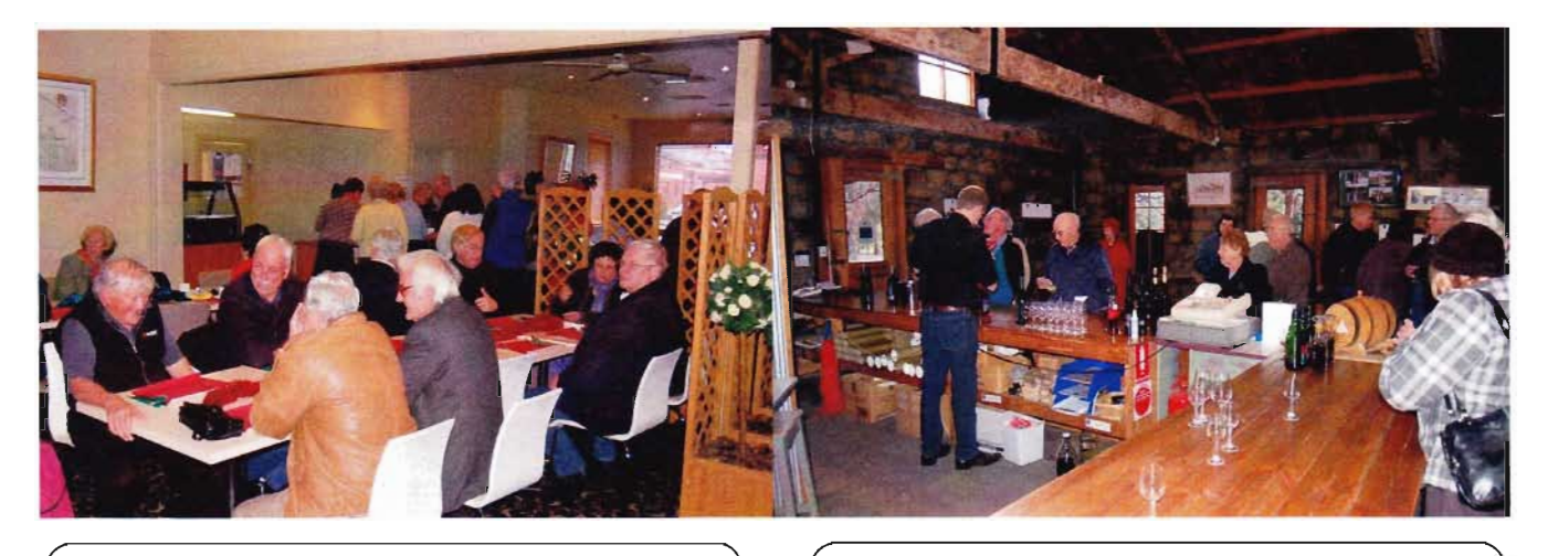
Enjoying lunch at the Golf House Hotel