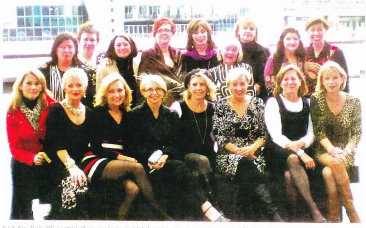
each ann faor left is aiger Rosson Vide Todata Daatong about a korroon, dator tod berton canota chitikasa oo 17 hele dae pari oo datama Kaplande oo dataa koo asti u moo oo atrono datama korroon korroon, korroon korroon a 18 hele waxa waxa coo datama ya Geparaja kati

Over the 1- year period the women have flown ter-13A. Australian Airlines and Oantas on both domestic and international route-