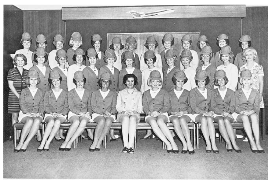
Hostess school 223 – Graduated in September 1970

Slowly we have been able to recover many photographic records of the staff who passed through the ranks of TAA, and again expanding our collection which is becoming a major interest for people who visit or have requests concerning people and the experiences of the second half of the 20<sup>th</sup> Century.