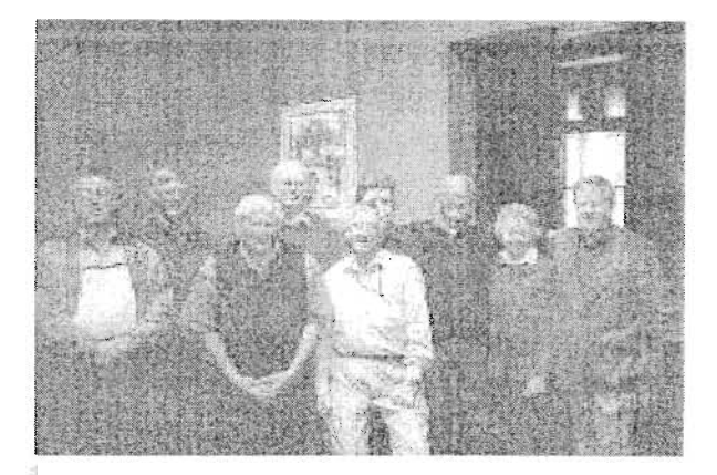
Your committee at the conference