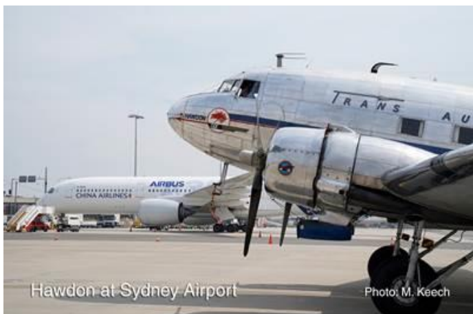
Hawdon at Sydney Airport